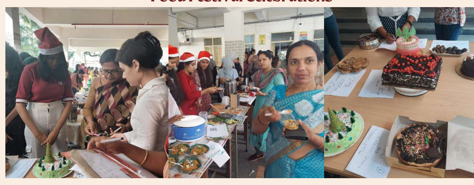
A food fest was organised by the college in which students enthusiastically participated by preparing various scrumptious snacks.