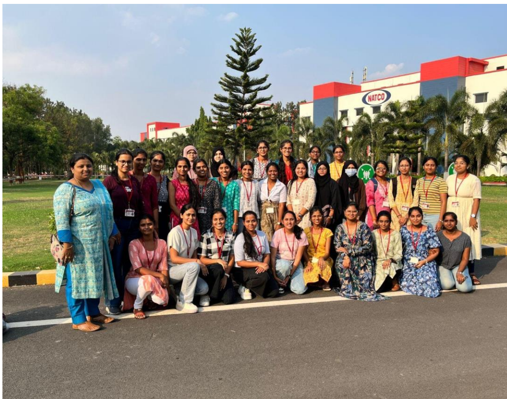
Fieldwork Conducted at Natco Pharma Limited

www.rbvrrwcp.org | Email: rbvrrwcoph@rediffmail.com & rbvrrwcp2006@gmail.com