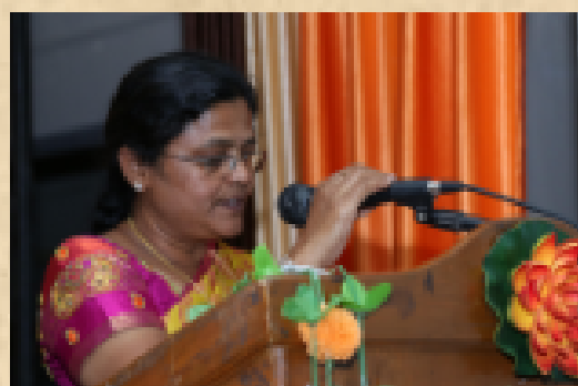
Seminar - Procurement of Research Grants