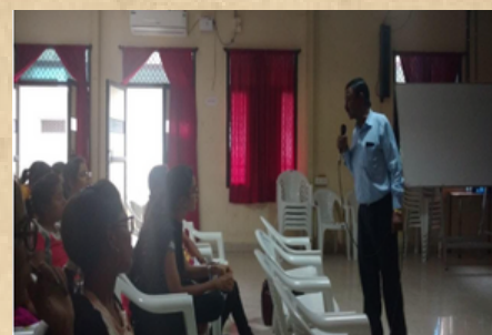
Seminar - Intellectual Property Rights