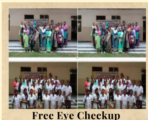
Free Eye Checkup

RBVRR Women's College of Pharmacy, in collaboration with Dr. Harikishan Eye Care, hosted a Free Eye Check-up Camp on October 16th, 2018. The event aimed to provide essential eye care services, focusing on raising awareness and identifying refractive errors in the community. A team from Dr. Harikishan Eye Care conducted thorough examinations, screening 58 attendees and providing glasses to 26 beneficiaries. Participants received guidance on maintaining eye health, highlighting the importance of regular check-ups. This initiative not only improved vision and quality of life but also promoted proactive eye care and community engagement, showcasing a commitment to public welfare.