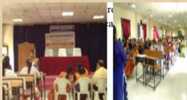
Vigilance Awareness week : Eradicate Corruption-Build a New India

RBVRR Women's College of Pharmacy, in collaboration with the Employees Provident Fund Organization, organized Vigilance Awareness Week from October 29th to November 3rd, 2018. The week-long event featured a relocation competition and an essay writing competition focused on the theme of eradicating corruption to build a new India. Students from Pharm D and B Pharm enthusiastically participated in both competitions, demonstrating their engagement and commitment to promoting vigilance and integrity.