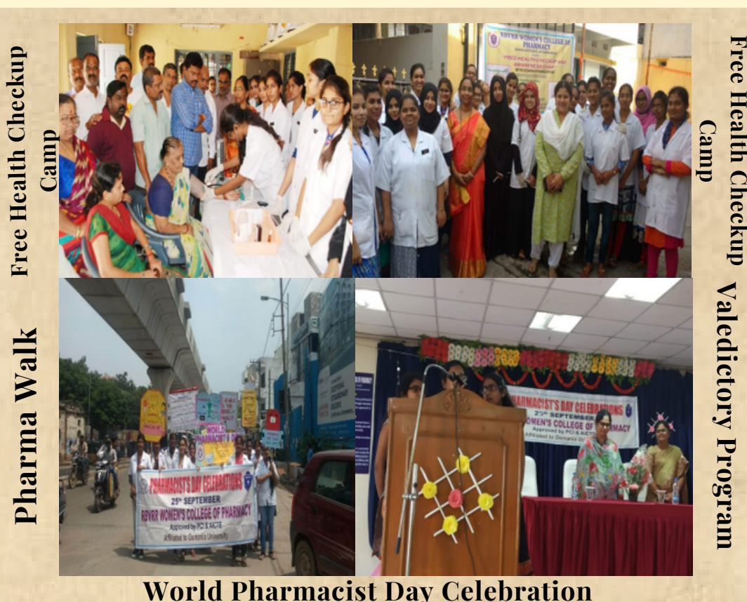
Free Health Checkup Camp