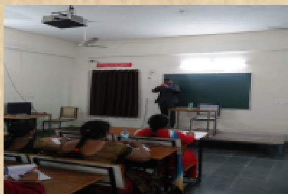
Three Day Workshop - Chemo Informatics in Drug Discovery