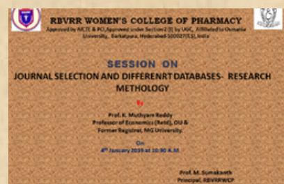
Seminar - Journal Selection : Different Databases