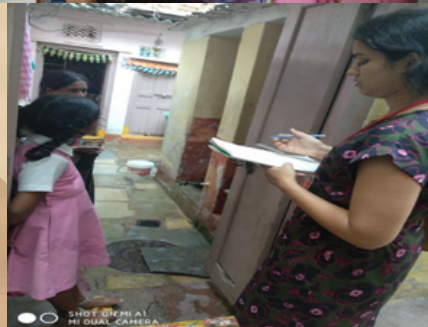
TB Awareness Programme

Students from RBVRR Women's College of Pharmacy actively participated in a tuberculosis (TB) awareness program on 23rd March, 2019 held in Hyderabad's Ram Nagar area. Their involvement highlighted the college's commitment to community health. The students engaged local residents through educational activities such as distributing pamphlets, conducting interactive sessions, and having one-on-one conversations. They emphasized early detection, treatment, and prevention of TB, empowering the community with essential knowledge. This initiative not only supports the fight against TB but also underscores the importance of student-led community engagement in addressing public health challenges. Ongoing efforts in organizing such programs will continue to foster healthier communities in Hyderabad and beyond.